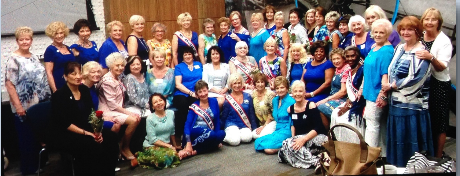
March Birthday Ladies